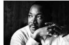
Dr. M.L.King Jr.